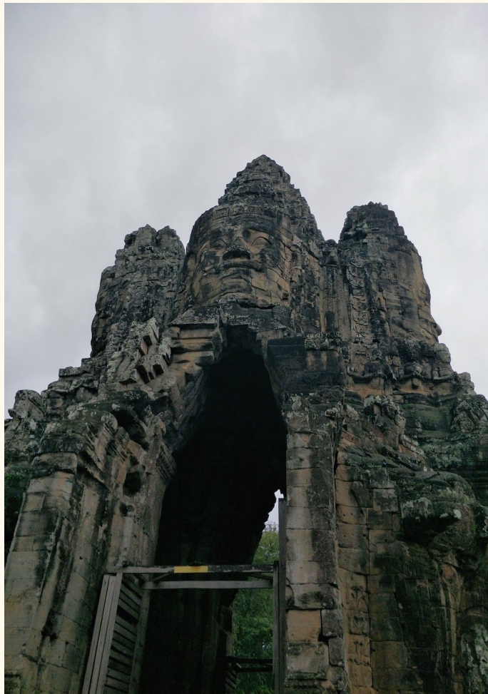
(4 faces of Lokeshvara)

Angkor Wat was built for people dedicated to the God Vishnu. The temple complex has become the largest religious monument. It has measuring 162.6 hectares or 402 acres. There are 50 temples around the complex of Angkor Archeological Park but the famous is just 10 temples. Angkor Wat have Hindu and Buddhist Relief. For the example in Ta Prohm, there are 4 faces of Lokeshvara at the front gate and