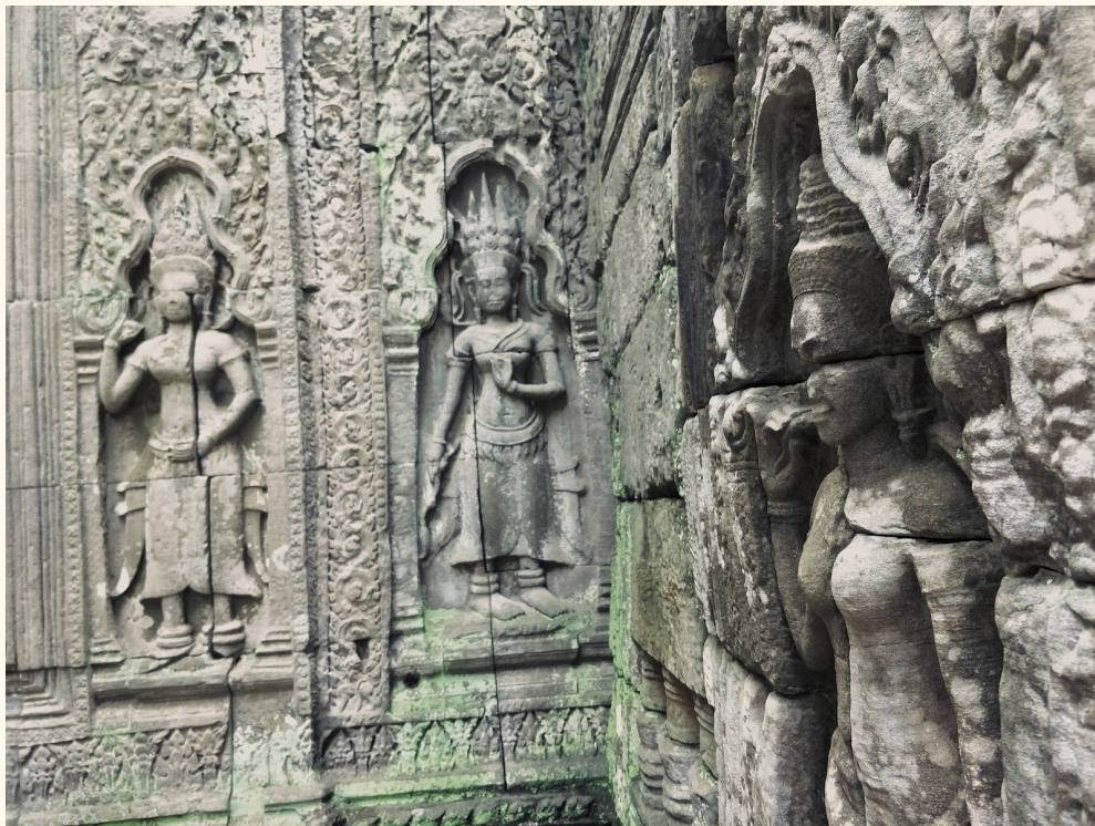
(The Relief in Angkor Wat)

From the relief, Angkor Wat have similarity with Prambanan temple. Prambanan and Angkor Wat was built as Hindu temple. So, they have the same relief because contain the story of Hindu teachings. Also, I see the bathing place in Angkor Wat that similar to Tamansari in Yogyakarta.